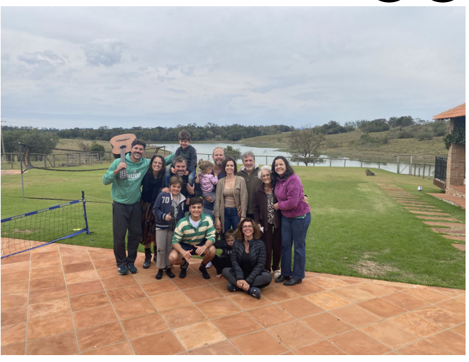
Figure 2. A moment of joy with my entire family in 2024.

I continue to invest in the area where I have published the most, which involves Obsessive-Compulsive Disorder (OCD). My work is mainly focused on clinical phenotypes, their underlying neurobiological signatures, and how this knowledge can be transformed into treatments that provide some relief for individuals with OCD and their families. More recently, I have redirected my focus to the early identification and intervention of mental health disorders in individuals at risk for such disorders. In 2023, we created the National Center for Science and Innovation in Mental Health (CISM) (www.cism.org.br). Through this grant, which receives public and private funding, we aim to identify modifiable risk and protective factors in a cohort study involving individuals at risk for mental health disorders. A fascinating part of this project is the development of scalable digital mental health solutions based on these risk factors that we are testing in pragmatic clinical trials to promote improved mental health. Additionally, other interventions are being tested in individuals who have already been diagnosed but do not have access to treatment. Once their effectiveness is demonstrated, these interventions will be implemented in two separate cities in Brazil, providing evidence for the